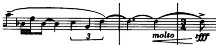
Figure 8: Variation on the opening motive heard in the trumpet.