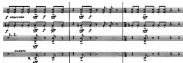
Figure 6: The first presentation of a Stravinsky-like rhythmic pulse found in the bassoons and horns.