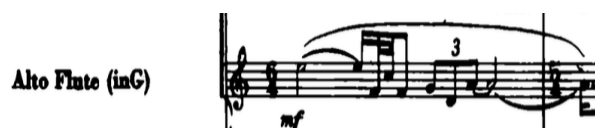
Figure 1: The opening motive played by the alto flute