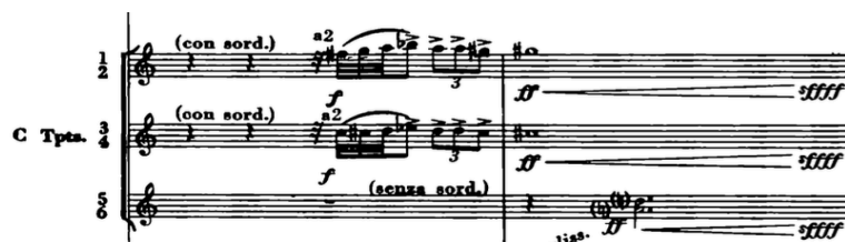
Figure 5: The first statement of the second motive, a chromatic trumpet fanfare.