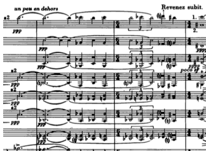
Figure 7: 3 rd motive, which is found in horns and bassoons and is used as a transition throughout the piece.