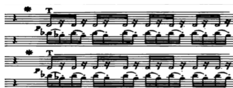
Figure 3: m. 2, harp tapping the soundboard while playing.