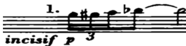
Figure 2: m. 2, a chromatic ascent to a minor 3 rd found in the bassoon